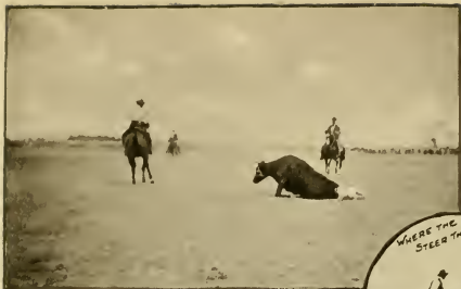
WON'T STAY DOWN